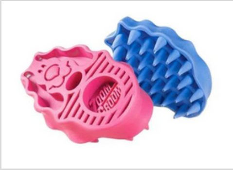
For quick tips click here