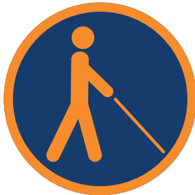
Orientation & Mobility