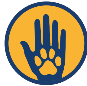
Volunteers and Team Members