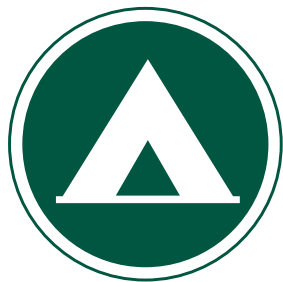
Teen Summer Camp